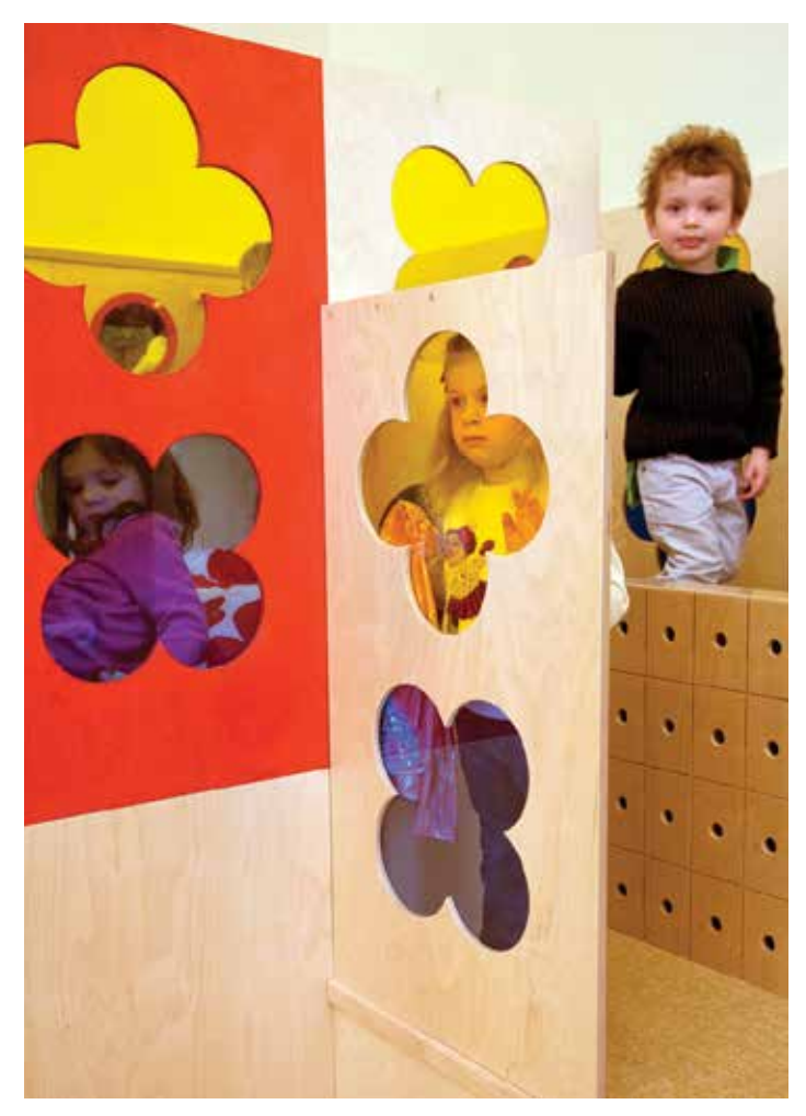
Architecture Is Fun's design for St. Chrysostom's Day School achieved needed vibrancy and community vitality, reclaiming a formerly underused space and repurposing it with endearing architecture meant for play, storytelling, and exploration.