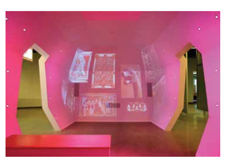
The Cave installation at Young At Art features 5,000 years of images of art and its histories set to music.

For this complex and varied project, Peter notes that generating data-rich models enabled exemplary coordination with the building architect and consultant's BIM models. Often, the exhibit concept was in development before the interior space, so having a comprehensive model informed the architectural design. In addition, the building is operated by a public entity that values the model in real time for monitoring systems and other facilities management needs. Architecture Is Fun's Vectorworks files also integrated seamlessly with those from other software platforms, Peter explains. By using IFC to transfer important BIM data, or using DXF/DWG/DWF to transfer 2D information, Architecture is Fun is able to share 2D, 3D, and important semantic data with its design partners and clientele.