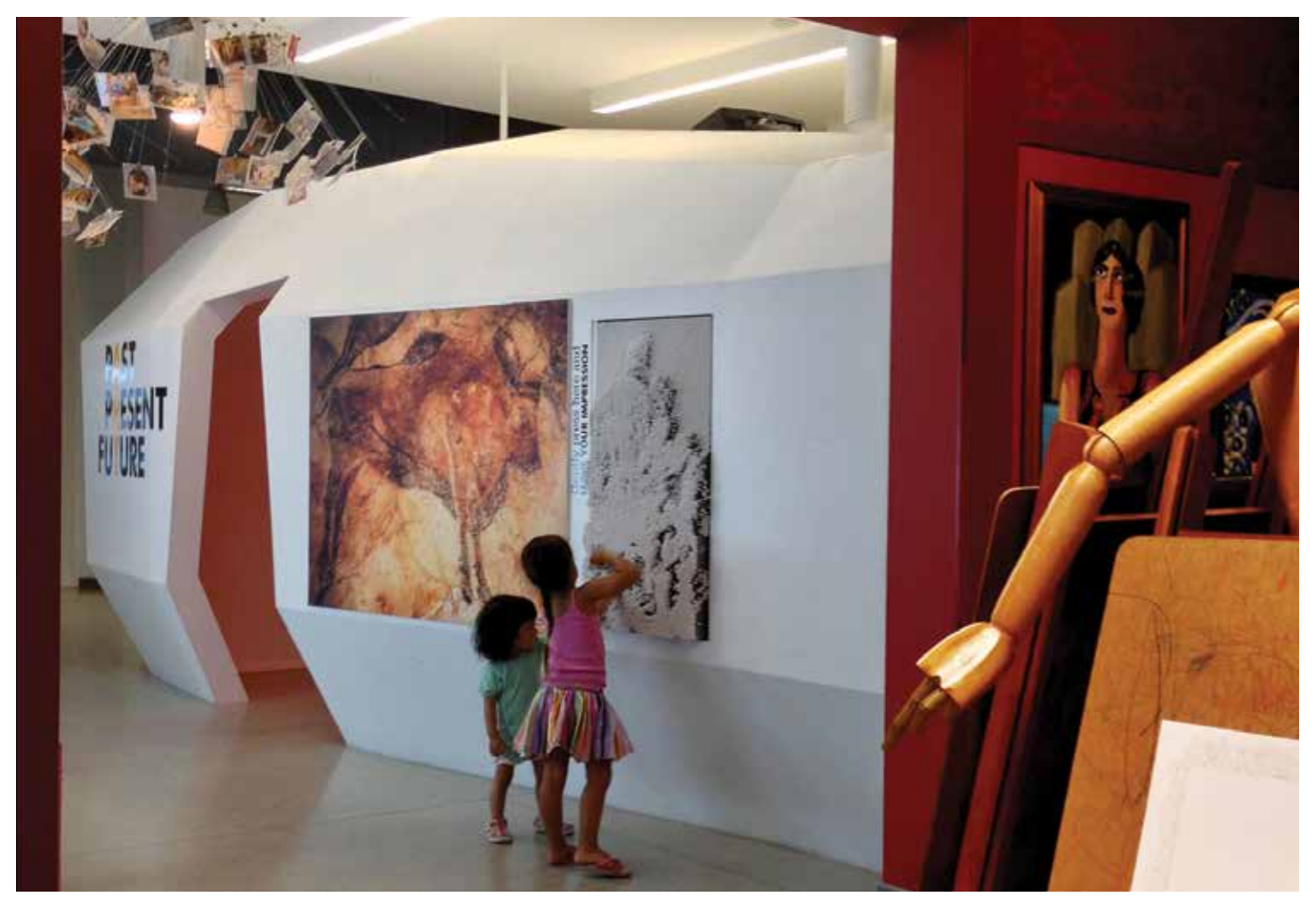
The Young At Art Museum's interior exhibits, galleries, and art installations were enhanced by layers of meaning and method. All throughout the museum, there is beauty and the development of aesthetic study.