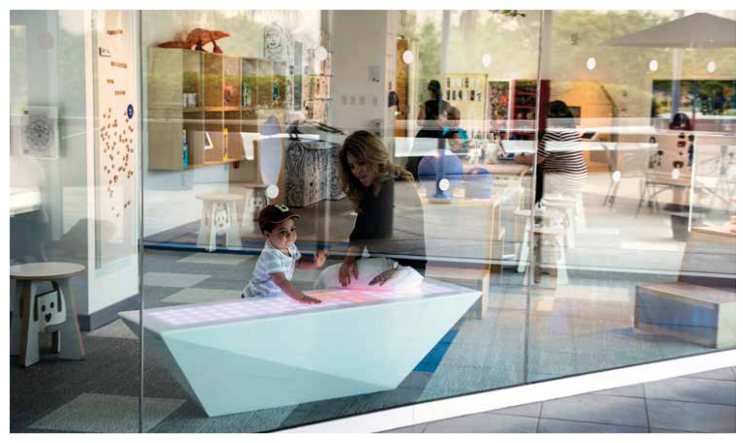
The Frost Art Museum is rich in evocative objects and commissioned art installations that inspire active learning, choices, and social engagement. The discovery gallery frames museum visits and was designed to be worthy of a child's curiosity and adult admiration.