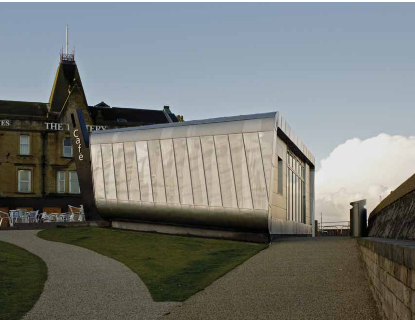
The land was sculpted to raise the café above the sea wall while contrasting with the architectural stone of the town.

Rather than aligning the café and restrooms architecturally, Lee chose a different approach. He wrapped the leaning rounded rectangular frame of the café with a strip of shiny stainless steel. Meanwhile, he designed the restrooms to be a steel black cuboid. Lee describes the contrasting structures as "taking on the quality of autonomous objects deposited on the tide line." While both are softened by the beach on one side and a tiered patio on the other, they are a sharp contrast to the older architecture in their backdrop.