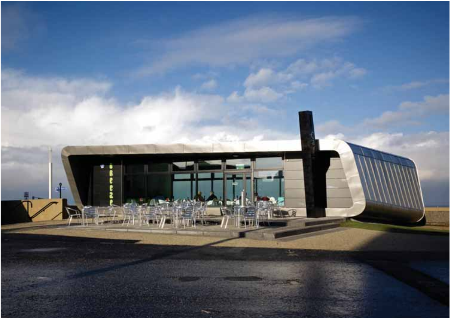
View of the sunny south elevation from the street, showing the silver 'ribbon' element framing the view.

Lee, a Vectorworks® software user since 1988, used the Vectorworks Architect product to overcome these challenges. Using the program's high-quality 3D and rendering capabilities to produce visualizations helped the team to build a consensus among the council and the local community. When Arca changed the original material from rubber cladding to stainless steel, it was easy for all stakeholders to see the difference in the elevation drawings and approve the change. Lee's team also typically works in 3D to better visualize their work, and this capability helped them understand the Silver Café's more complicated geometry. "The ability to use a similar toolset for 3D work makes it easier for designers to use the 3D capabilities for communicating complex problems, or for more formal presentations," he says. Arca uses CAD software for all of their projects,