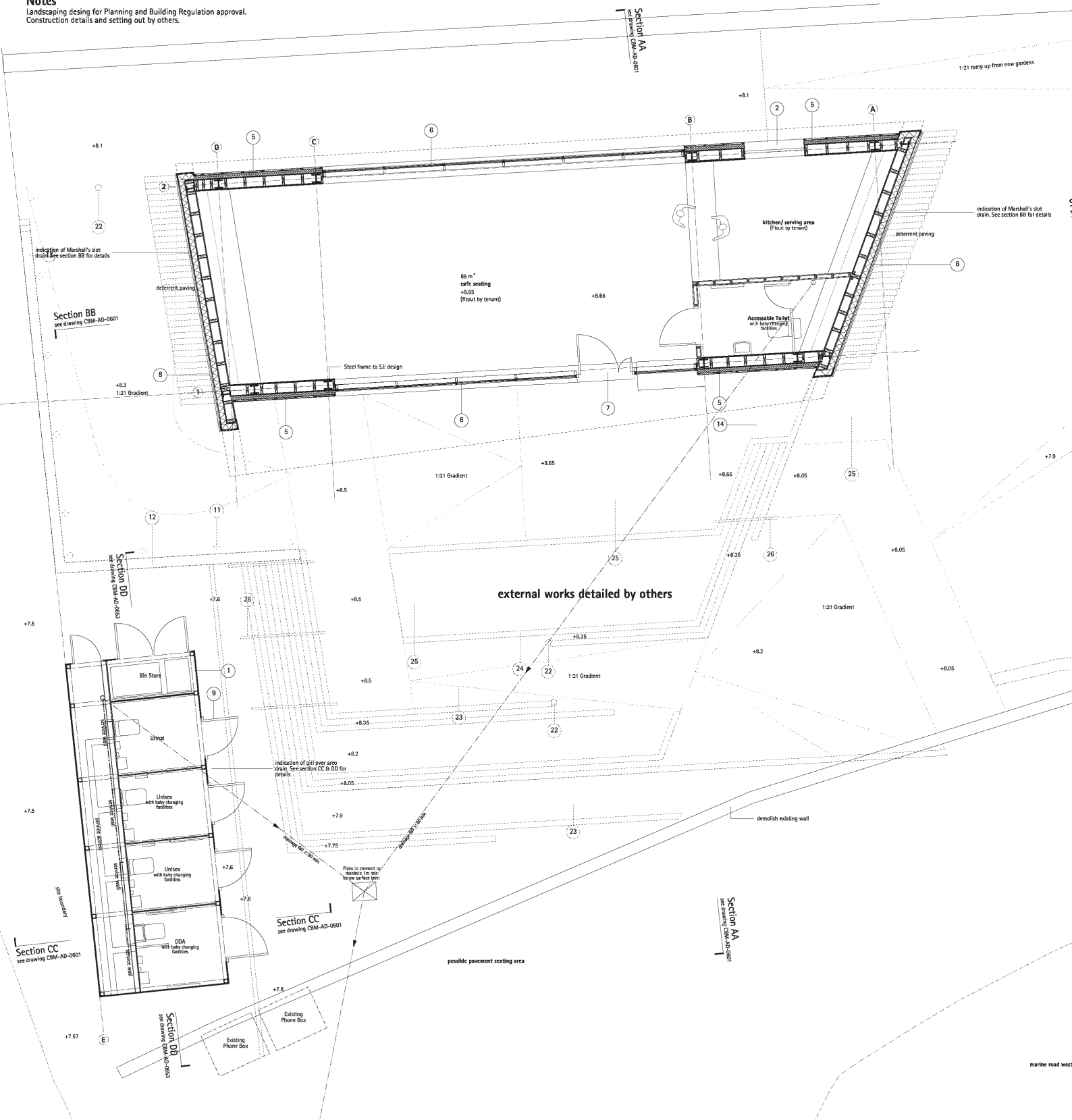
Plan Scale 1:50

Notes Landscaping design for Planning and Building Regulation approval. Construction details and setting out by others.