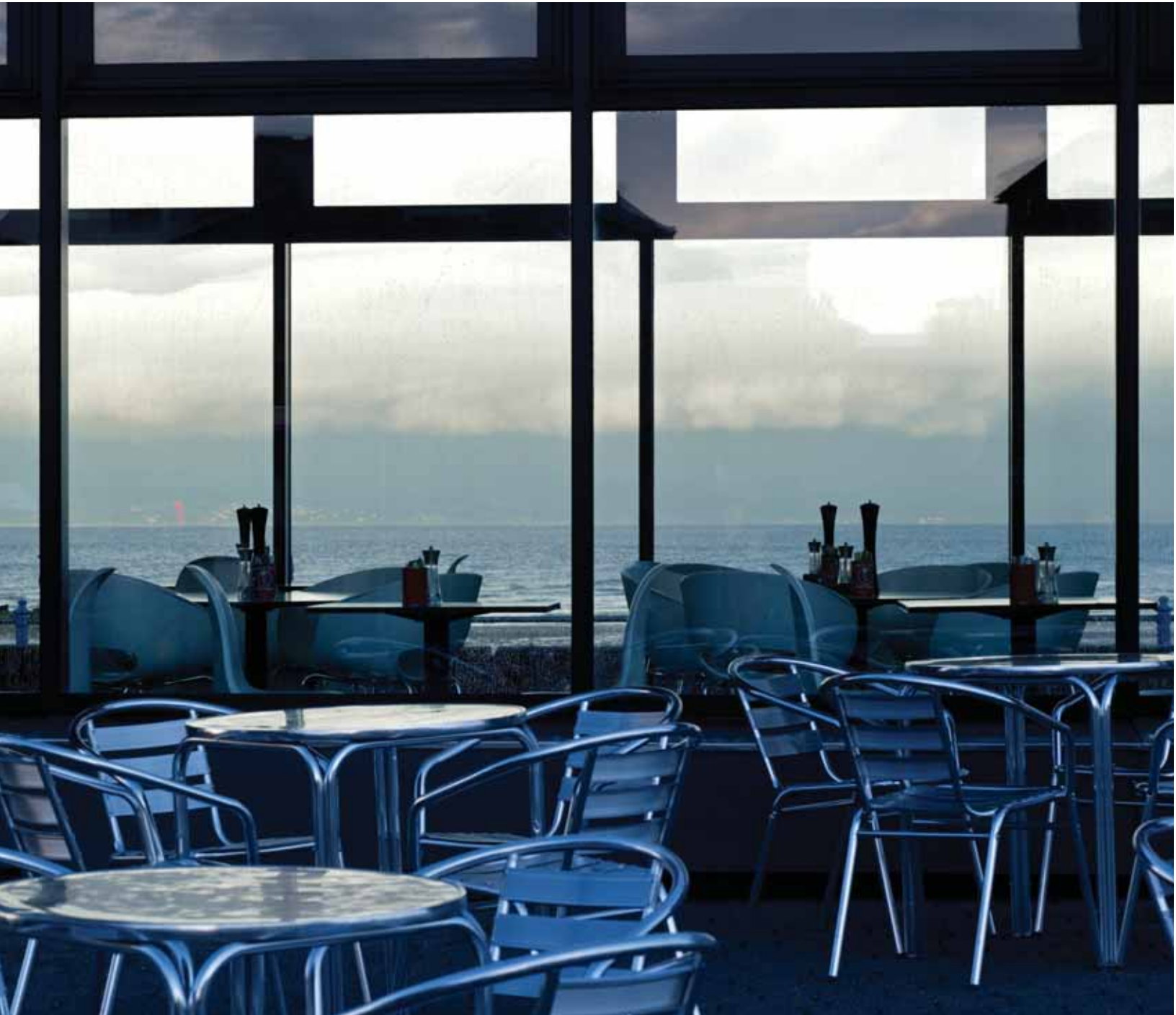
The aim of the building was to create a sheltered café space with panoramic views of the spectacular Morecambe Bay.